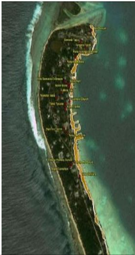
The village of Omoka located on a narrow low lying strip of land.