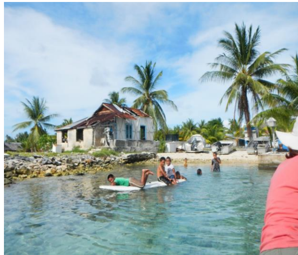
Children swimming in the lagoon in Penryhn

Te tautua is the smaller of the two main settlements on the Penrhyn atoll in the Cook Islands. Penrhyn is an island of the Northern Cook Islands, and was given its name by the crew of the Lady Penrhyn, commanded by Captain Sever who landed on the island on their way from the Isle of Wight to set up the convict colonies in Australia. The island of Penryhn is traditionally known as 'Tongareva.'. Tongareva is variously translated as 'Tonga floating in space', 'Tonga in the skies' or 'Away from south'. With its remote location, it was easy to see why early Polynesian settlers believed the island floated in a vast space. The name Penryhn is more commonly used when referring to the island, and is a Welsh name that means 'peninsula'.