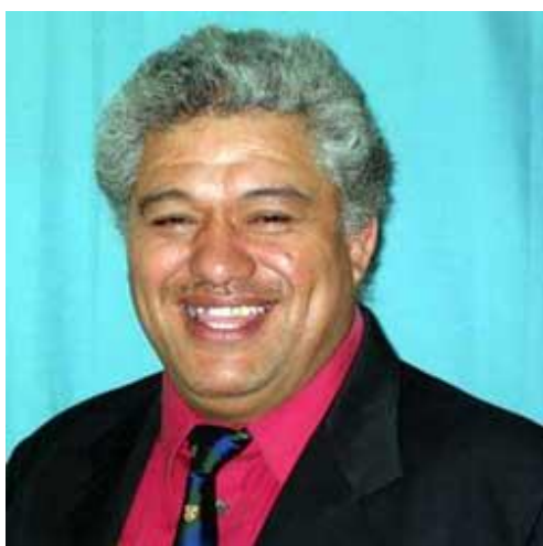
MP: William (Smiley) Heather

William Kati (Smiley) Heather (born 7 July 1958) is a Cook Islands politician and former cabinet minister. Heather was born in Rarotonga and educated at Arorangi Primary school and Tereora College in the Cook Islands and Onslow College in Wellington, New Zealand. From 1980 to 1997, he worked as a public servant in the Cook Islands Ministry of Works before being elected to Parliament as a member of the Democratic Party in the 2006 snap election. In December 2009 he was appointed to Cabinet as Minister for Transport, Infrastructure & Planning, and Energy. He was re-elected at the 2010 election. In August 2012 he was elected Deputy Leader of the Democratic party. In June 2017 he became leader of the opposition again.