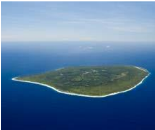
The island of Mauke from the air

Mauke, traditionally known as Akatokamanava is an island in the southern group islands of the Cook Islands. Mauke geography is a raised atoll encircled with a close fringing reef. The island has a circumference of 18 kilometres. Mauke has four districts: Areora, Makatea, Ngatiarua, and Vaimutu, with a population of about 300 people