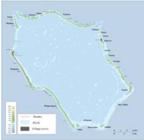
The northern island of Penryhn