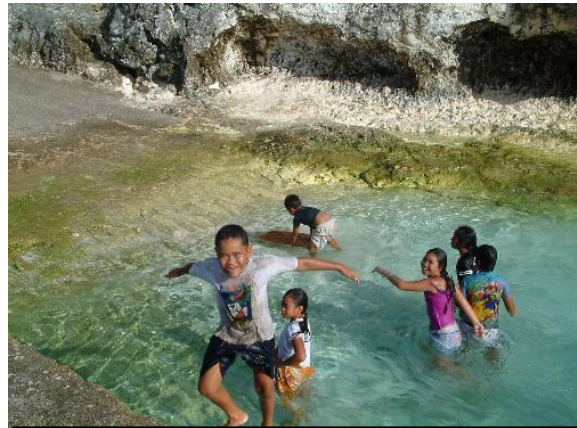
Children swimming in one of the coastal inlets in Mauke