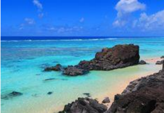
Black Rock – a popular swimming spot in the village of Nikao

Nikao-Panama is located on the North Westerly side of Rarotonga, and is the location of Rarotonga's only Airport. Nikao-Panama residential population is made up predominantly of Cook Islanders who have migrated from the other islands of the Cook Islands, collectively referred to as "Te Pa Enuā". The majority of the Nikao-Panama community do not have land ownership rights to the land that they live on in Nikao-Panama and are thus dependent on communal halls and spaces to host meetings, family events etc.