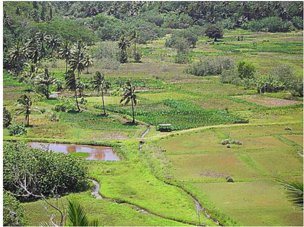
The Agricultural production land of Tamarua

Tamarua is a village located on the island of Mangaia. Tamarua is one of the six traditional districts of the island of Mangaia in the Cook Islands. It is located in the southeast of the island, to the south of the district of Ivirua and east of the district of Veitatei. Mangaia is the most southerly of the Cook Islands and the second largest, after Rarotonga. Geologists estimate the island is at least 18 million years old, making it the oldest in the Pacific. The island of Mangaia rises 4750 m above the ocean floor and has a land area of 51.8 km 2 .