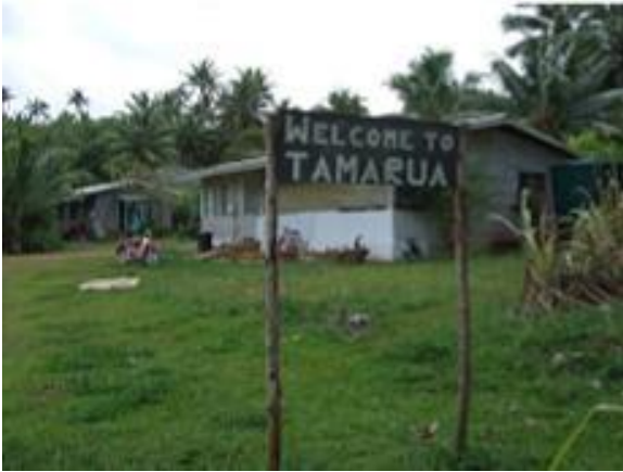
The village of Tamarua