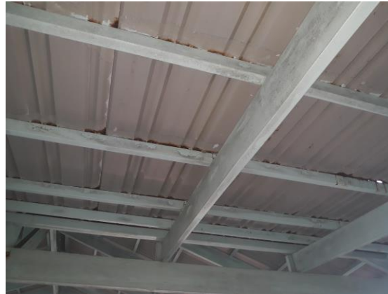
Nikao Panama Recreation Centre – Rust spots and holes in the roof.

The Nikao-Panama recreation centre is one such communal space that is essential to the residents of Nikao-Panama and their way of life.