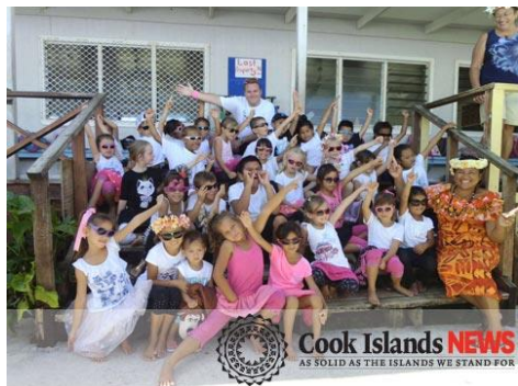
Classroom of children at Te Uki Ou primary school where Ake attends